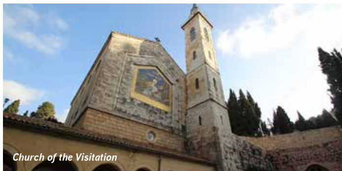
Church of the Visitation

We will take a morning drive to the top of the Mount of Olives for a panoramic view of Jerusalem and visit two churches located on the mount: the Church of the Pater Noster, built over the caves where Jesus taught His disciples how to pray the “Our Father,” and Ascension Chapel, the site from which Jesus ascended into Heaven. Descend the mount on the path Christ walked on the “Palm Sunday Road” to Dominus Flevit, where He wept over Jerusalem and her future destruction. Then enter into the Garden of Gethsemane where Christ had His agony and was betrayed. Here we will pray in the Church of All Nations at the Rock of Agony, the very rock where Christ prayed and sweated blood before He was crucified. This afternoon we drive to Ein Karem, one of the most beautiful sites in the New City of Jerusalem where St. John the Baptist was born. Marvel at the Visitation Church where Mary proclaimed her service to God in her Magnificat prayer and pray the Magnificat together in this holy site. Before returning to our hotel for the evening, we will visit the Saxum Center to learn more about the history of the Holy Land. (B, D)